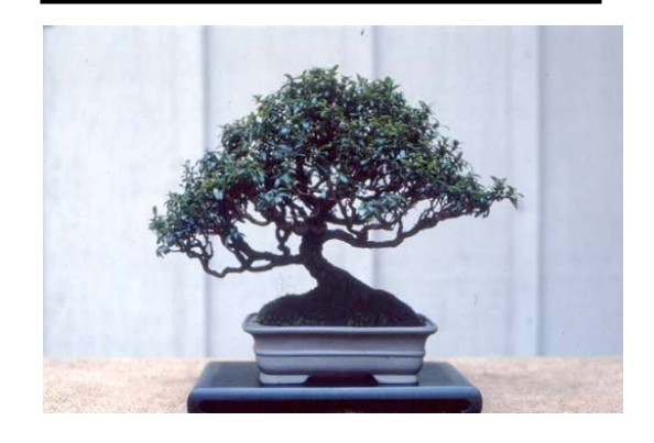
Fig. 15: Myrtle from Figures 13 and 14, now fourteen years from a cutting.

and left them under the fluorescent lights for as long as two weeks without problems. Well, some trees did die when I pulled the bags off before I realized it was necessary to go through the programmed re-entry again.