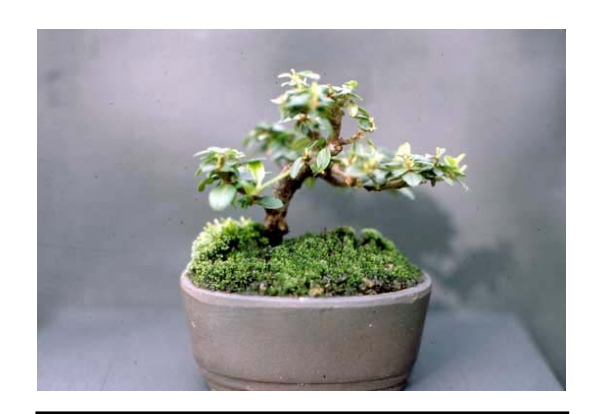
Fig. 6: Pyracantha coccinea brought indoors as rooted cutting and grown as bonsai under fluorescent light one year.