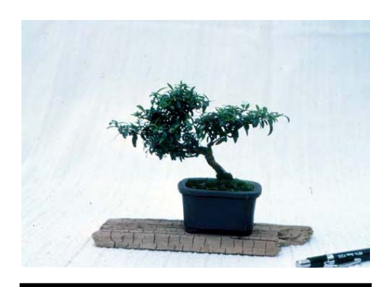
Fig. 13: Dwarf Greek myrtle, Myrtus communis 'Compacta', three years from a cutting rooted under fluorescent light.

The same technique can be used during vacations. Before I accumulated too many indoor bonsai for it to be practical, I watered my trees well, bagged them