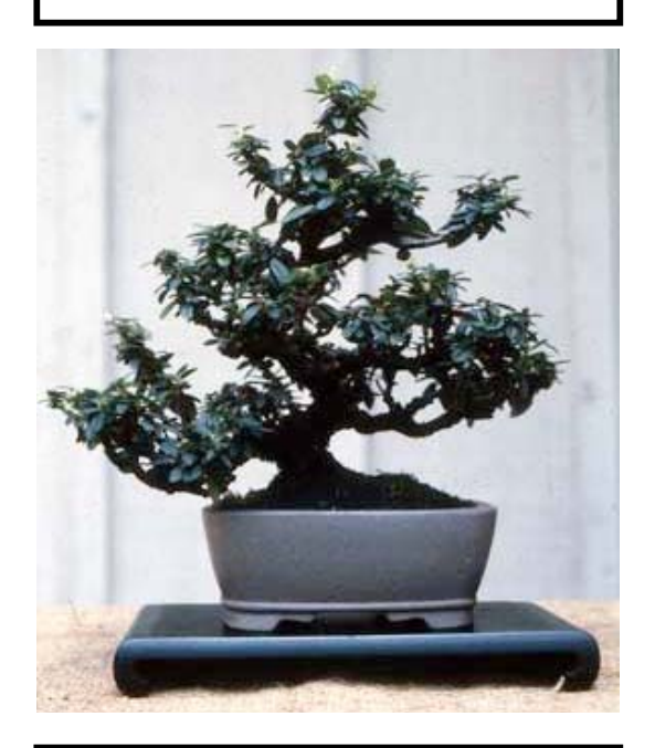
Fig. 8: Pyracantha shown in figures 6 and 7. Now fifteen years under fluorescent light.

change one of the tubes in a two-tube unit one day then wait a day or two