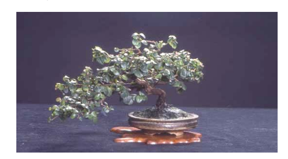
Fig. 4: Chinese Sweetplum ( Sageretia theezans ), popular as bonsai material in the warm climate parts of China. Grown from a cutting in ten years under cool white fluorescent light.

Having said you can grow bonsai in window light, I still feel you make it easier for yourself and your indoor trees --- especially if window space is limited --- if you substitute even the most