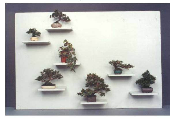
Fig. 2: Fluorescent light bonsai on exhibit stand. All bonsai in display no more than six years from cuttings.

Aha! This might be a way to use those tiny pots and grow bonsai --- and grow as a bonsai enthusiast --- year around. Two small rooted cuttings of pyracantha were brought in from outdoors. The "shop light" was dropped down over my workbench next to the furnace. And the experiment, the indoor fun that continues today, began.