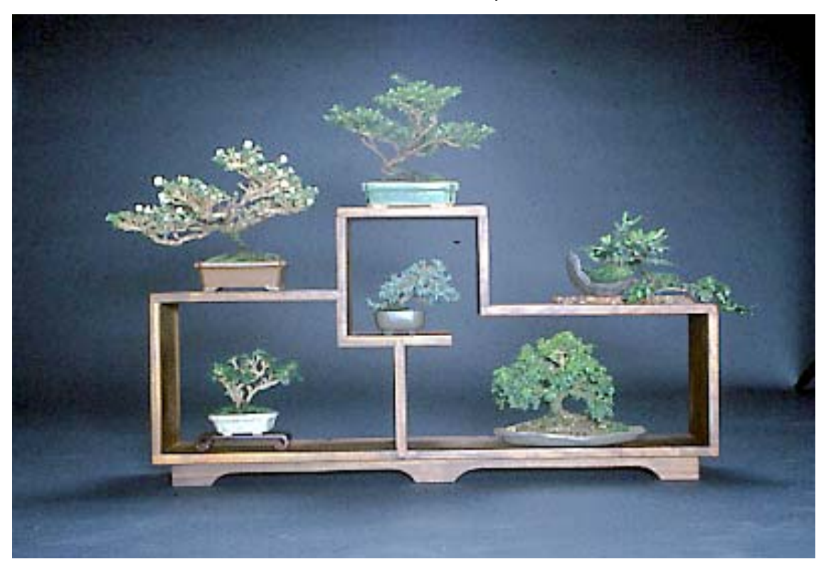
Fig. 10: Same juniper bonsai seen in Figure 3 – now ten years indoors – is centered in this display of the author's fluorescent light bonsai. Clockwise from the top, other kinds are: Cuphea, Abelia, Buxus, Ligustrum and Serissa .

as Miracid, Miraclegro, Peters 20-20-20 or Rapid-gro in very dilute solution applied almost every watering year around. When in a big hurry, an application may be skipped. This fertilizer solution is made up five gallons at a time by adding one level teaspoon of fertilizer to five gallons of water; so the concentration is one-fifth teaspoon per gallon. After watering well, some of this weak fertilizer solution is run through the soil. So, as stated earlier, this process leaches and fertilizes at the