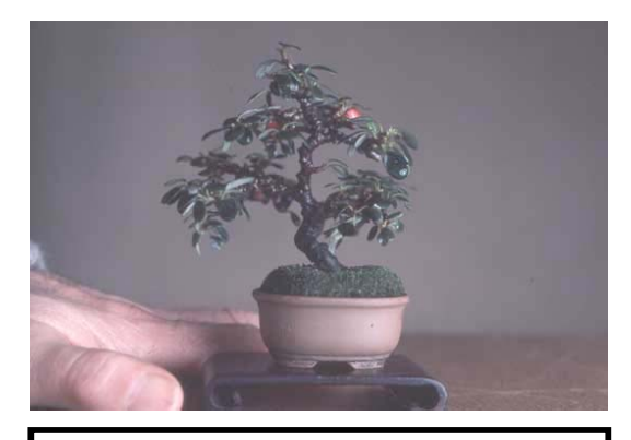
Fig. 11: Cotoneaster microphylla bonsai grown five years from a cutting, always under fluorescent light.

(Myrtus communis 'Compacta'); firethorns (Pyracantha spp.), especially the dwarf variety 'Teton'; azaleas (Rhododendron spp.), especially 'Hino Crimson'; Chinese sweetplums (Sageretia theezans); and serissas (Serissa spp.), especially some of the snow-rose clones.