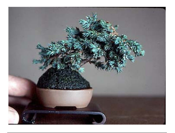
Fig. 3: This is a very common garden juniper ( Juniperus procumbens 'Nana'). Despite the opinion widely held in the bonsai community that junipers will not survive indoors, this tree has grown four years in this pot relying entirely on fluorescent light from cool white tubes.

It soon became apparent that fluorescent light bonsai growing offers a number of advantages. It is a very controlled situation with no weather extremes. Trees grow year around so one can practice and make bonsai progress year around. It is great winter