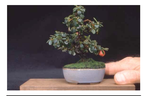
Fig. 12: Same cotoneaster shown in Figure 11, now thirteen years from a cutting.

Now, how about needle evergreens as fluorescent light bonsai? I have heard again and again that junipers ( Juniperus spp.) cannot be grown indoors for any length of time. I know that even if I swear here that my two oldest indoor