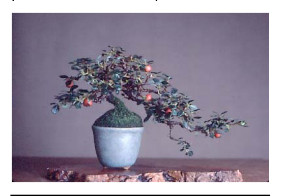
Fig. 9: Cotoneaster microphylla bonsai always grown under fluorescent light from rooting as a cutting fourteen years earlier.

found I could water more efficiently using a small watering pitcher with a fine spout. Unfortunately, the pitcher that functioned well was metal and eventually rusted out. The plastic replacement widely available, about one and a half quart capacity, didn't work nearly as well because its spout had a much larger opening and the heavier water stream tended to wash soil mix out of little pots. After struggling with this for longer than one likes to admit, the thought occurred that it might be possible to alter this spout to limit the