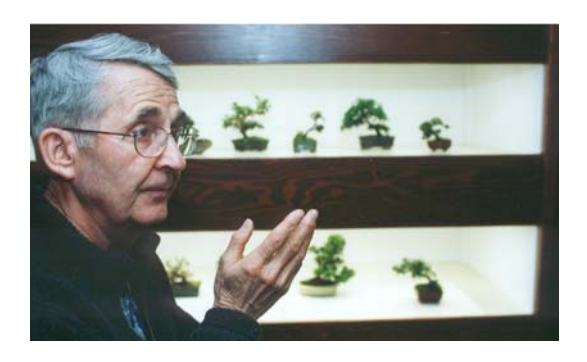
Fig. 1: Author and his bookcase-like growing cabinet. A standard, two-tube, 40 watt, fluorescent light is hidden behind cabinet facing above each shelf.

In 1976, when my first experiments with growing little trees under fluorescent light began, I had one distinct advantage over today's bonsai beginners. At the time, I hadn't read a lot of books and articles making the whole project sound almost impossible. I hadn't been told you have to mist the foliage regularly. I hadn't been told I'd need a humidifier or cool mist vaporizer. I hadn't been told vou have to run a fan to circulate air. I hadn't been told cheap, cool white, fluorescent tubes need to be supplemented with incandescent bulbs. And, I hadn't been told most plants grown indoors still need a cold rest period with temperatures below 50° F. for several weeks each year.