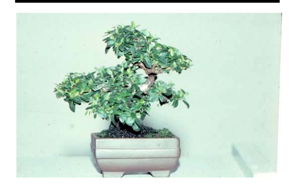
Fig. 7: Same pyracantha shown above but now five years as a bonsai under fluorescent light. This tree can also be seen farthest right in Figure 2.