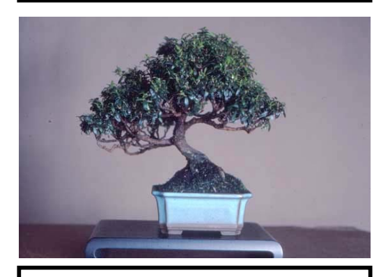
Fig. 14: Same myrtle seen in Figure 13, now ten years from a cutting.