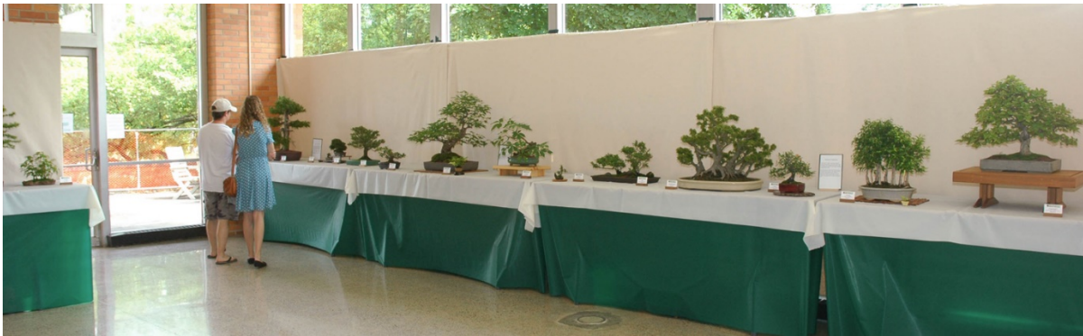
2014 Annual Show.

"I've told members often, pick out one of your trees you like and do what you can to clean it up for exhibit. Eliminate or hide what you don't like and try to make it look as nice as possible. You will almost always be surprised at how well you like your show candidate tree after a little hands-on attention."