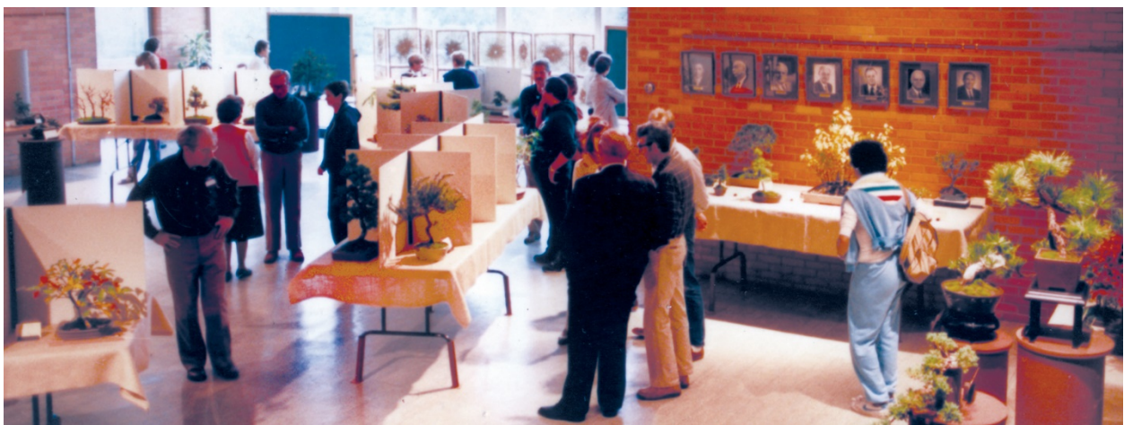
1984 Annual Show.

“Our exhibits are a way of reaching out to members and encouraging deeper involvement, and a way of reaching out to people who may be candidates for membership. In short, our exhibits are a way of communicating with each other as members and of communicating with the public.”