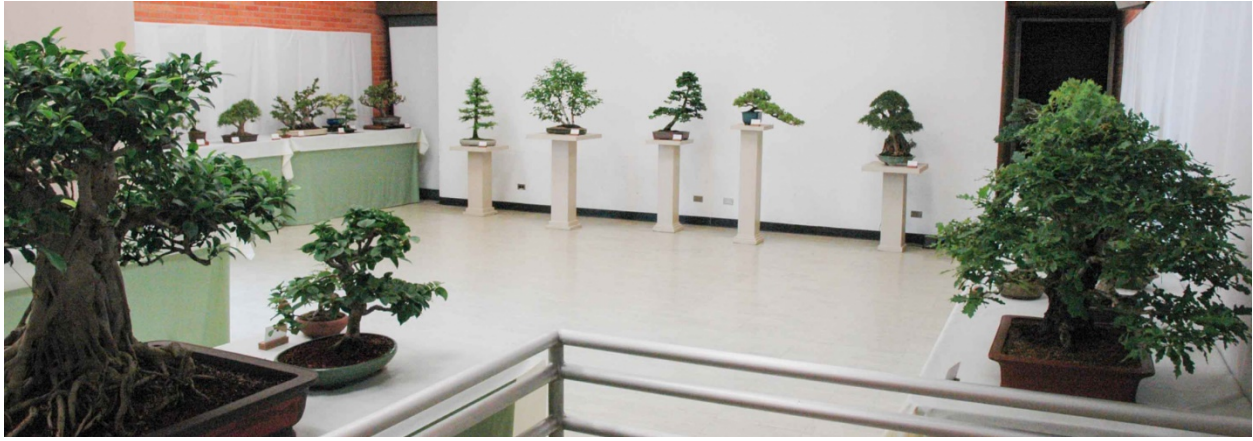
2009 Annual Show.

"I remember being asked some years ago by a relatively new member why one particular tree, a small juniper, was included in our exhibit. When I explained that it was being exhibited by a very new, 10 year old member, her first bonsai, the questioner became, almost instantly, completely comfortable with it being there."