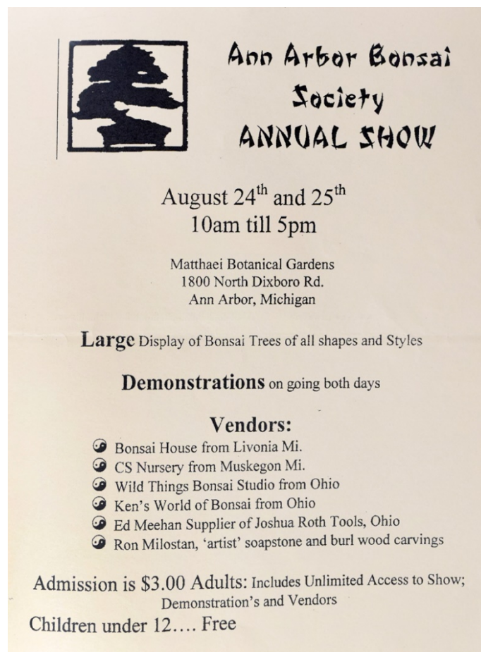
2002 Show Poster.

"Some people enjoying a bonsai exhibit are questioning, "How do they do that?" Some are thinking, "I could never do that." And seeing the wide variety of trees people are working with and enjoying, some people suddenly realize, "I could do that," or "I'd really like to try that."