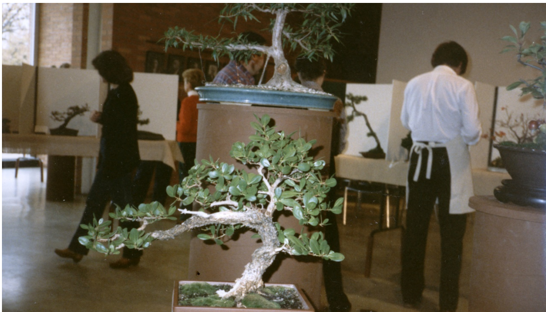
1985 Annual Show.

"After many years of involvement with our AABS Annual Exhibit and other bonsai exhibits, I still find it very satisfying to see visitors coming, looking intently at our trees and smiling. And, it is still especially gratifying to see someone really looking closely at one of my own bonsai."