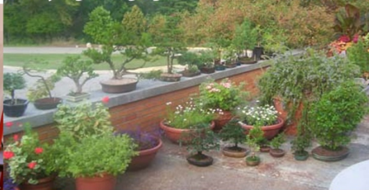
Friday night staging area of submitted trees