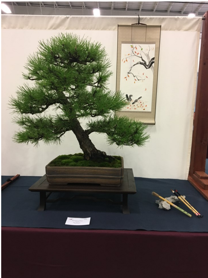
Don Wenzel -