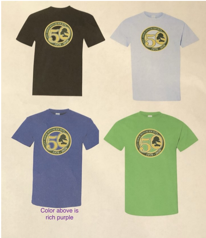
Color above is rich purple

Ads in the Newsletter: All members can offer for sale any bonsai and bonsai related materials in the newsletter or at the monthly meeting with no sales fee. AABS Society Members' ads are free to publish in the Newsletter. Deadline for submissions to the Newsletter is the 5th of the month.